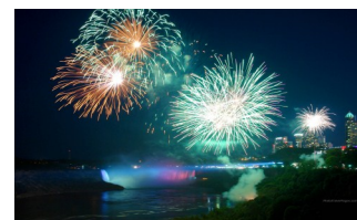
Free Fireworks over the Falls Schedule to be determined. Please stay tuned for updates.