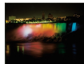
Nightly Illumination of the Falls

May 1-Aug 11 9pm-12am Aug 12-Sept 8:30pm-12am Oct 1-Nov 4 7pm-12am Nov 5-Dec 30 5pm-12am Dec 31 5pm-1am